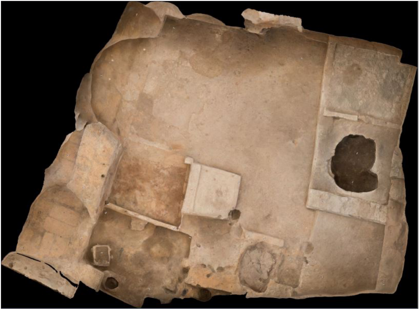
Figure 4. Floor F.8698 in Space 637, Building 150.

platform from the east-central platform F. 8664. It was made of bricks that were later carefully covered in plaster.