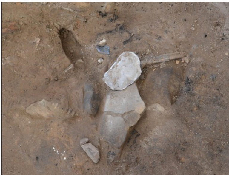
Figure 6. Cluster F.8687 (23765) containing mostly large animal bones and grinding stones.

In the southwestern room of B.150 (F.8672), a wall (F.3899) was built on top of the edge of a truncated platform F.8750 from Sp.639. In the infill deposited against this wall and the outer wall of the building in its southwest corner, two distinct clusters of numerous objects of different kind (F.8687 (23765) and F.8650), mostly grinding stones and large animal bones, were discerned. The former cluster was exceptional in terms of a variety of finds including numerous large animal bones such as scapula, mandible and some long bones as well as maple vessel, crystals, human teeth, possibly animal skin, an oyster and large number of worked stones and obsidian (Fig. 6). These items were placed on a kind of mattress made of leaves. The cluster represents a deposit made of intentionally selected objects of each kind.