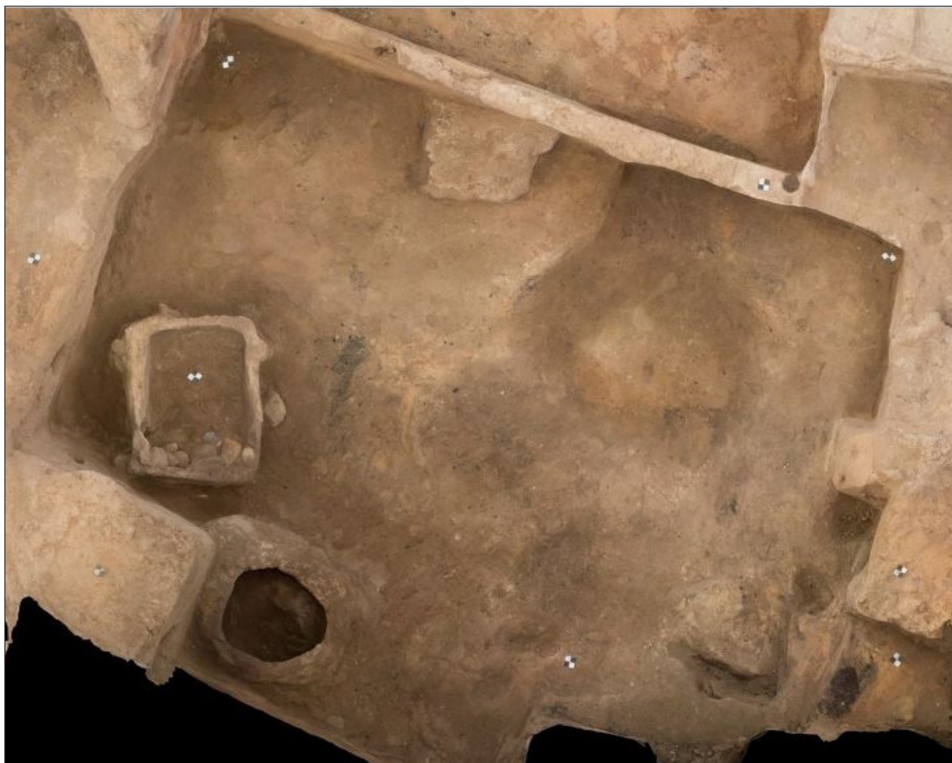
Figure 2. Orthophoto showing features in southwest room of Building 150 (F.8672).

This is the earliest exposed phase of B.150, recognized only in its southwestern part. It is impossible to determine whether it represents its construction phase, as neither floor nor deposits beneath the floor have been reached. The building's walls have been discovered and exposed: west wall (F.7357), north wall (F.8288, F.8267), both discovered already in the 2015 season (Marciniak et al. 2015), south wall (F.7499) and east wall (F.8762). They were all unexcavated.