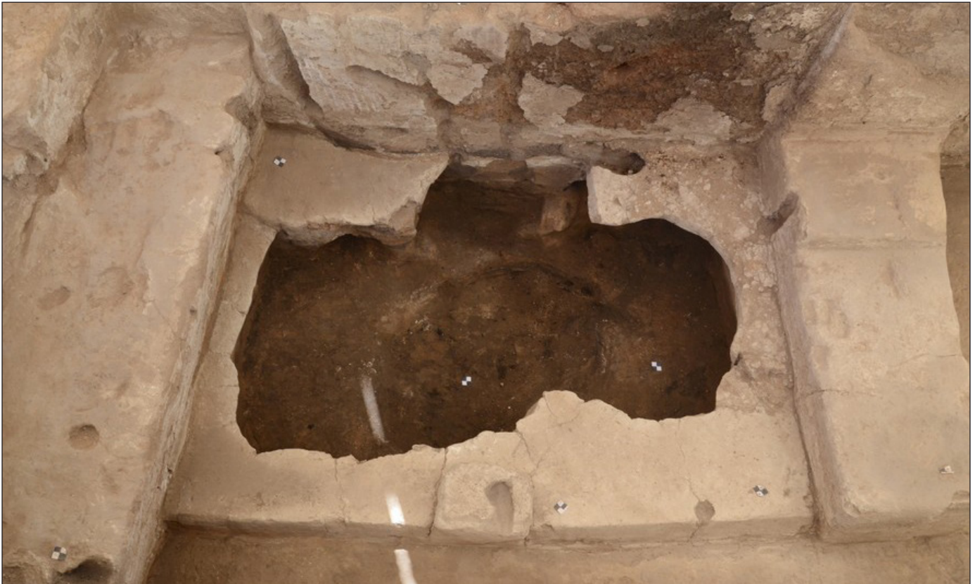
Figure 9. Burial cuts (F. 3888, F. 3889, F. 3890) in platform F.8262, Space 562, Building 122.

The late burial sequence was recognized as three cuts (F.3888, F.3889, F.3890) an intercutting sequence of similarly sized burial pits, all sub-rounded pits from c.0.40 m to c.0.63m in wide c.0.34m to c.0.55m in length and between c.0.20m to c.0.61m deep. The fills of all these burials were firm and compact silt-clays ranging from light brown to more orange brown in color, which were visible on top of the platform (F.8262) surface, all contemporary to each other (as the cuts were found in the same level of a compound plaster layer sealing the top of the infills). In addition, the three cuts are placed in a north-south sequence (Fig. 9).