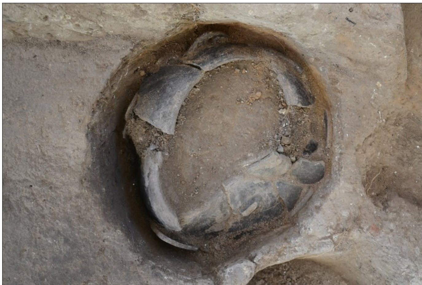
Figure 7. Pot deposit F.3882, Space 612, Building 150.

Interesting features comprised two circular pits with vessels (F.3882 and F.3865) deliberately cut into the floor (Fig. 7). They seemed to represent an intentional deposit, similar to other deposits with vessels associated with platforms in B.150 (Marciniak et al. 2016). Another interesting deposit comprised a shallow pit F.3894 with three large stones placed at its bottom (23748) that was cut out in a very central part of the floor.