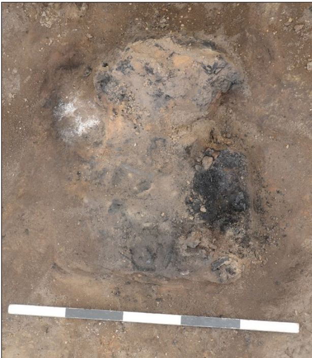
Figure 3. Cluster (F.8678) in southwest room of B.150 (F.8672) containing two reed containers with seeds.

Out of these features, due to time constraints and ultimate completion of the project, only bin F.8674 was completely excavated. It was rectangular in shape and had the following dimensions: 0.52m x 0.38m x 0.14m. It contained a cluster of considerable large number of stone tools and worked stones (32860), including a polished mace-head made of red marble and two nicely finished pounding tools. Some of the stones were also embedded into the walls of the bins (32864) (see Chapter 16, Ground Stone ). Some animal bones and obsidian point were also intentionally deposited in this bin. The walls and the base were carefully plastered. The base was uneven and sloping towards the south. Interestingly, it was set upon a sort of a clay pedestal that contained some kind of deposit made of stones and animal bones, which were very carefully plastered over with the bins' base. Another bin (F.8692) associated with this floor, albeit unexcavated, was placed against the very southwestern corner of room. It was round in shape with 0.45m in diameter and had thick, undercutting walls. It seemed to be empty, but was only partially excavated, as the season was coming to an end. The plastered feature F.8752 was not excavated.