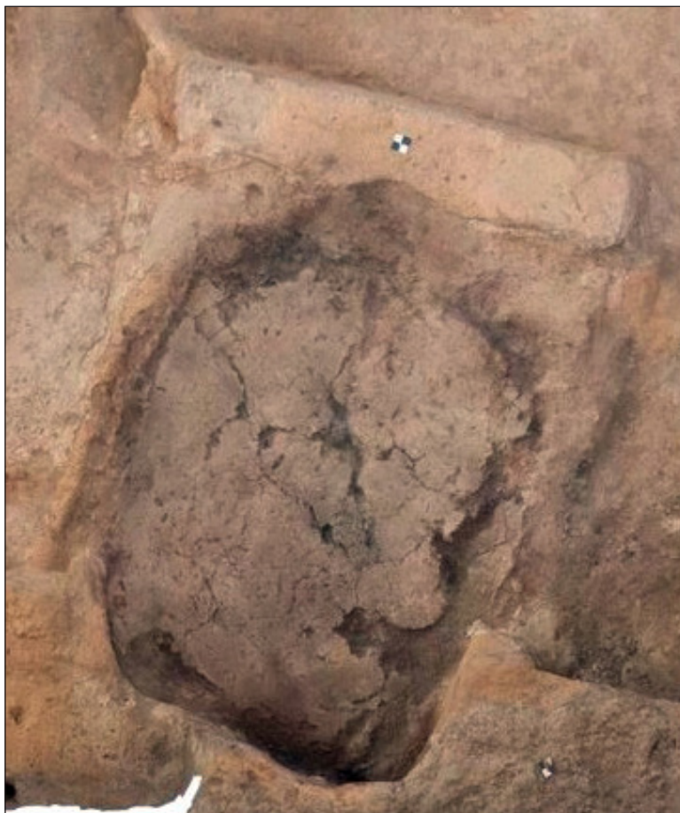
Figure 5. Oven F.8756, located in the south part of Building 150.

similarities; they were quite large, oval in shape and had a distinct solid base. The earliest oven F.8756 in a sequence from Sp.637 was left unexcavated.