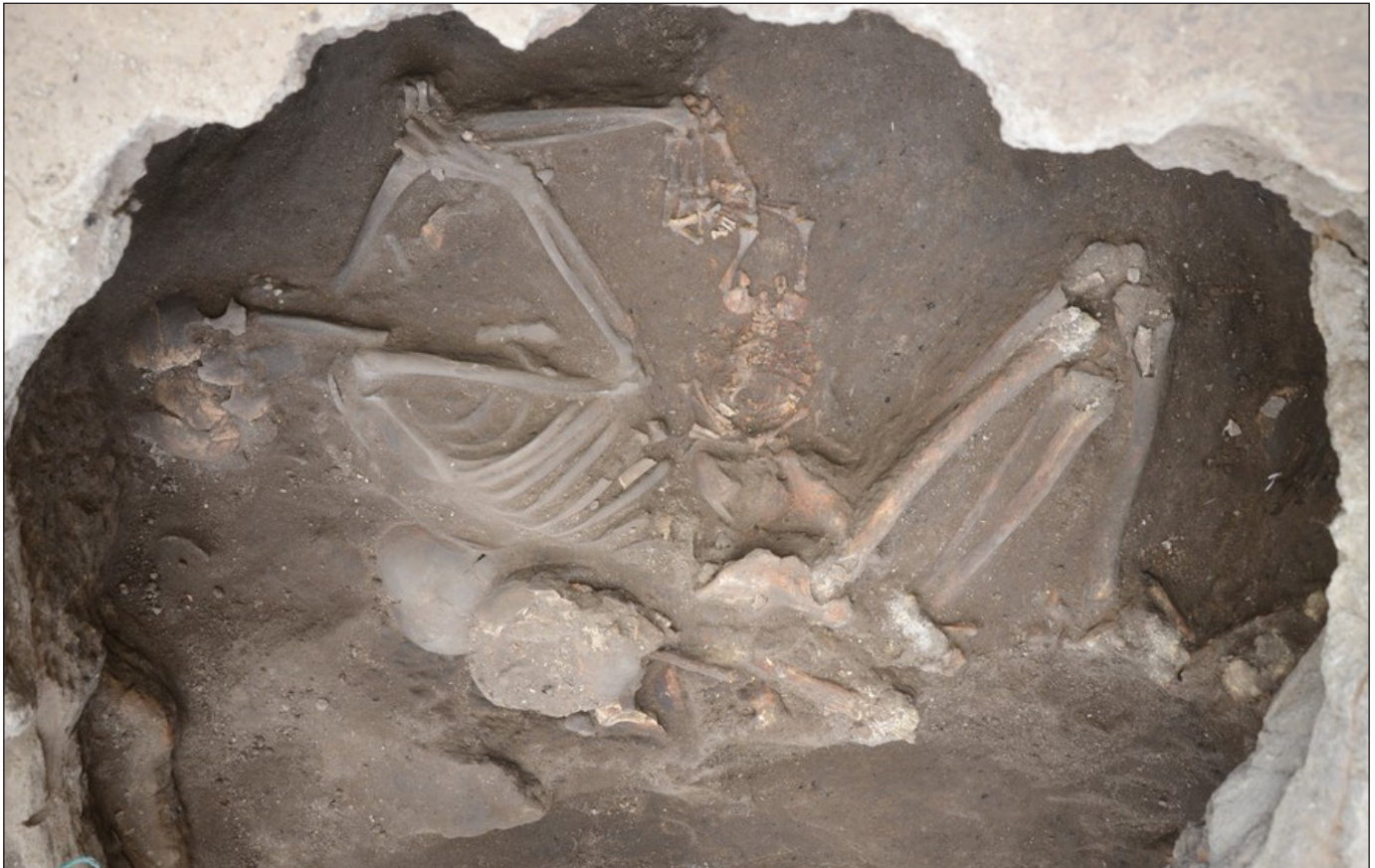
Figure 8. Burial F.3868 in central east platform (F. 3855) of Building 150.

Two burial pits (F.3867 and F.3868- the former truncating the latter), were identified already in 2016. They were dug into central part of platform F.3855. Right next to the northern edge of burial F.3867, two complete anthropomorphic figurines (20736.x1 and 20736.x3) were found (see: Marciniak et al. 2016), most likely associated either with the platform construction or a specific burial event.