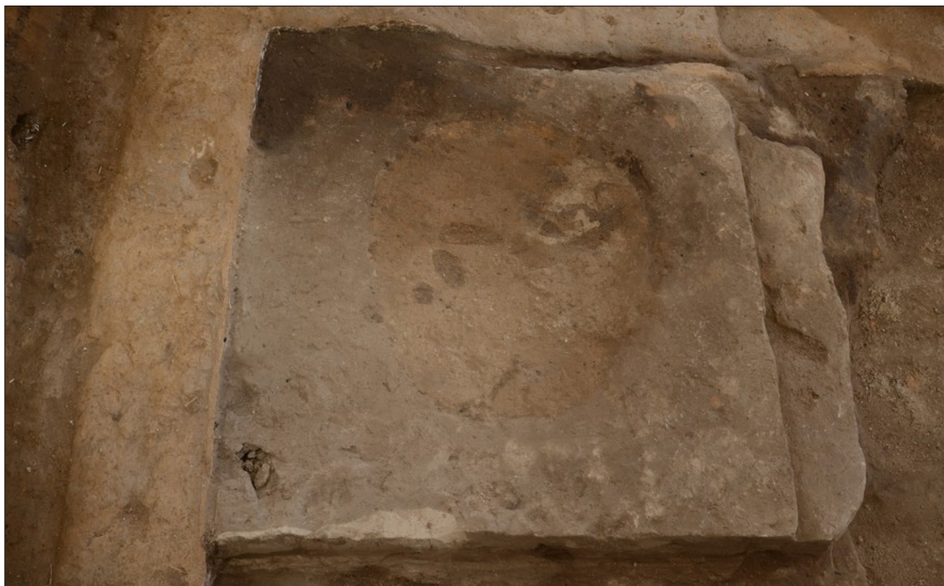
Figure 10. Platform F.7173 with burial F.3891 visible on its surface.

tively. Platform F.8660 from the very northeast corner of the building was constructed of a friable constructional layer (23969) and much more compact layer (23967) of molding making the structure solid. The platform surface was covered by silty and very firm layer of plaster (23968). The platform F.8661 was very badly affected by the post-Neolithic truncation F.8665 (destruction cut 30887), which significantly damaged almost entire central part of the building. Due to this destruction only its northernmost part survived. It was made of a constructional layer (23967) (same as in the platform F.8660) and fairly thin plaster layer adjacent to platform F.8660 in its northern part (23966). Despite severe damage, two burial events were defined (F.3896 and F.8661) (see more: Chapter 5, Human Remains ). The burial F.3896 was situated in a distinct pit (c.0.92m long, 0.58m wide and c.0.36m deep). The cut included two burials: (i) a completely preserved adult Sk (23921) laying on his back, slightly sloping on left side, and (ii) a headless adult Sk (23772) placed directly beneath the former one. The bones were in an exceptionally good state of preservation. The burial cut was filled with distinct silty-clay (23914) and (23770) layers. The second burial F.8662 contained an infant skeleton Sk (23961). It was in a flexed position and was interred in a shallow cut (23945), itself placed directly on the surface of the earlier platform F.8670.