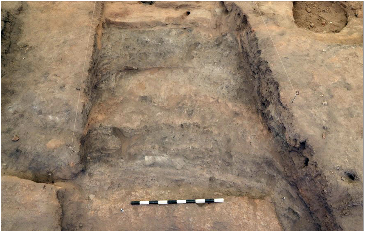
Figure 11. Midden (23956) located west of B.166, Space 638, South Area.

With the aim of discovering the relations between B.166 and the corresponding structures in the South Area, two c.2m wide strips were excavated, one parallel to the southern part of the eastern wall of the South shelter, and the other perpendicular to it. The latter trench reached the eastern edge of structures excavated in 2004 and 2005 (Regan 2004, 2005), in particular the platform F.1312 located next to the western wall of B.44 (F.1340). The platform, as well as primary leveling deposit (11626), extends outside the building wall further the west. A blocking F.8668 made of very firm clay (23980), and one course of bricks (23979) was later built on the platform surface. It most likely have closed down the access between B.44 and the area outside directly to the east. This blocking was