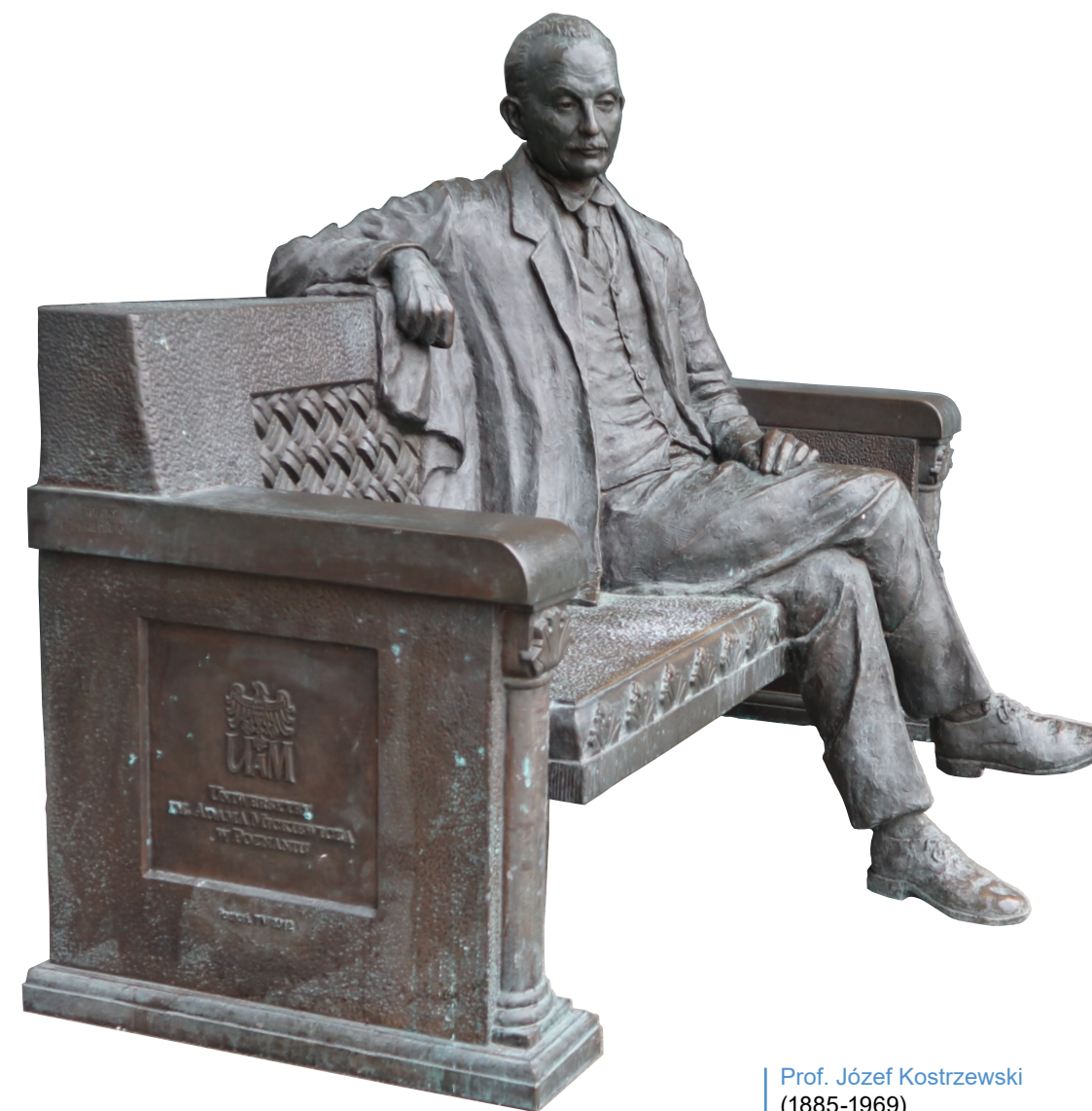
Prof. Józef Kostrzewski (1885-1969)

Currently, the Faculty of Archaeology of Adam Mickiewicz University is formed by a number of teams, each with their own leaders. In the majority of cases, these teams are united by interdisciplinarity, which integrates within selected projects the experience of many so-called 'auxiliary' sciences of archaeology. This trend is paralleled by the development of specialised laboratories armed with the latest equipment in the Faculty of Archaeology.